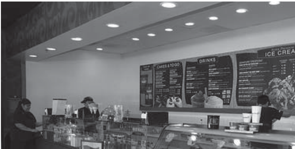
Thanks to Cold Stone Creamery in Price for being an Eastern region Partner in Parenting.

Partners in Parenting are local businesses that want to show their appreciation for all you do by offering discounts and specials to foster families.